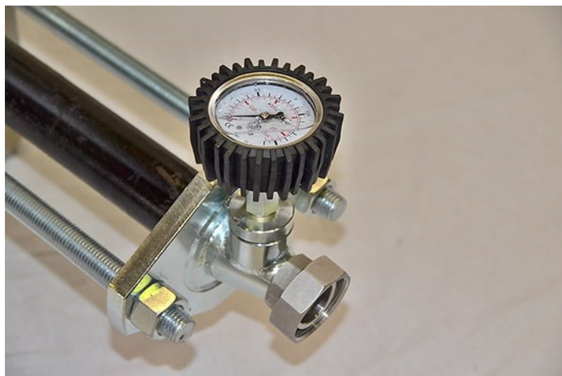
06600g – pressure gauge 40 bar kit