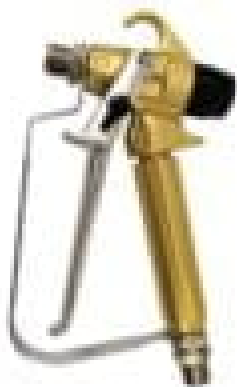
airless gun W650TOP (ref. 077400 )