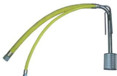
suction system kit, emulsions, S.S. (ref. 063152 )