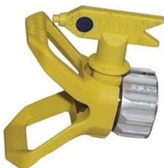
self cleaning tip c/w seal and guard (ref. 69AXXX )