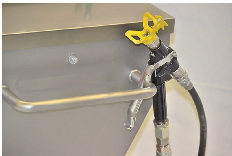
076800E – airless gun XXL-E electric switch