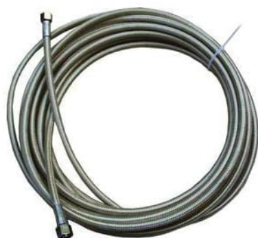
high pressure hose ø 6 mm, length 10 m. (ref. 060020 )