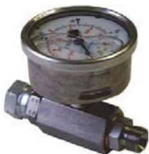
pressure gauge kit (ref. 066000 )