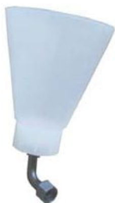
6 liters plastic hopper kit (ref. 003850 )